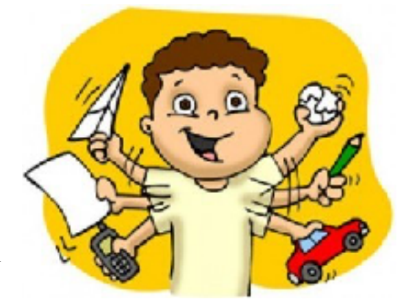
Myth # 4 Medications for ADHD have many side effects and hence need to be avoided.

combination of these 3 symptoms clusters. However the children who are Hyperactive - Impulsive or Combined type get picked up early. These children have trouble sitting at one place and are constantly in motion. They have difficulty in completing any tasks and are restless even while sitting. They tend to be impatient and would constantly interrupt others. Inattentive ones get easily distracted, appear lost and are often forgetful. In fact the commonest presentation is Combined type (50-60%) where the symptoms of Inattention, Hyperactivity and Impulsivity are present followed by Inattentive type (30-40%) and the least common one is Hyperactive-Impulsive type (10%). Diagnostic criteria for ADHD is DSM - V which helps to understand these kids to a greater extent.